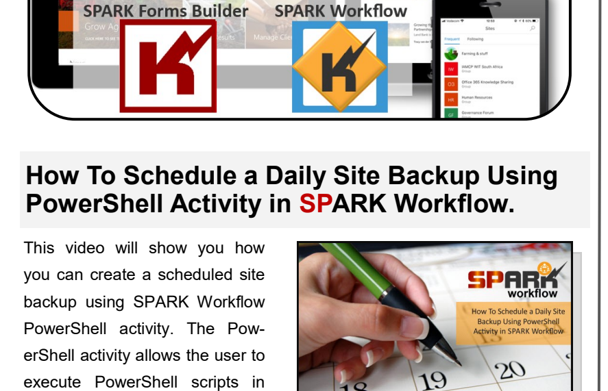
unlimited actions that you never Watch the video Now! thought you could do with workflows.