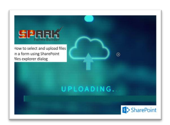
Watch it now!

With SPARK new release the designer allow his form's users to select and upload files to SharePoint and link them into the form through the files explorer dialogue and without the need to do any manual operations like what users have to do when using InfoPath forms. This can be done easily using SPARK Forms Builder by creating a simple rule on a button. In less than 5 minutes you will be able to provide your users with a great technique to work with files, images, etc.. And manage to integrate them with your different form's controls such as image and hyperlink controls.